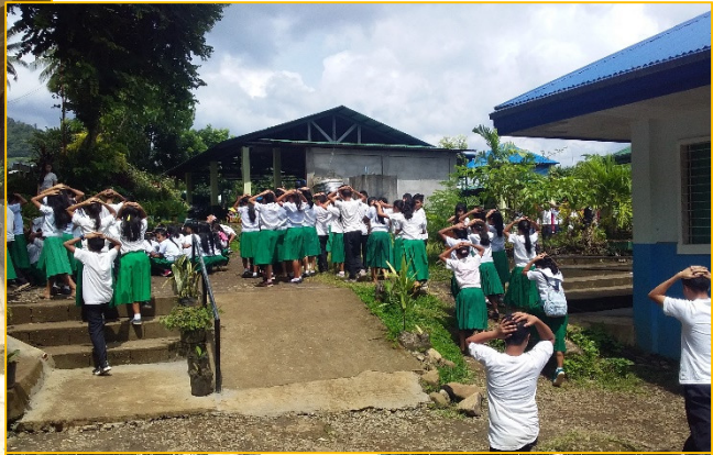
Participants proceeding to the evacuation after securing it is safe to do so