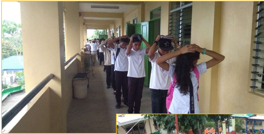
Participants proceeding to the evacuation after securing it is safe to do so